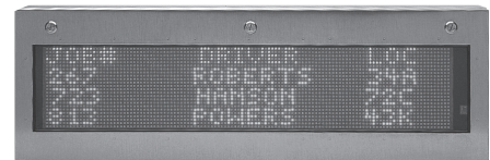
Cat. No. MC4-120C1-4X

Ceiling or Wall Mounting Kit for MC4 Series Message Centers — MC4-CWMK